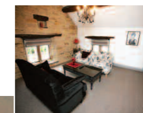
There was plenty of room to spread out in the Loren Suite (main picture and above), which featured original oak beams, stone walls and picture windows juxtaposed with chic contemporary design