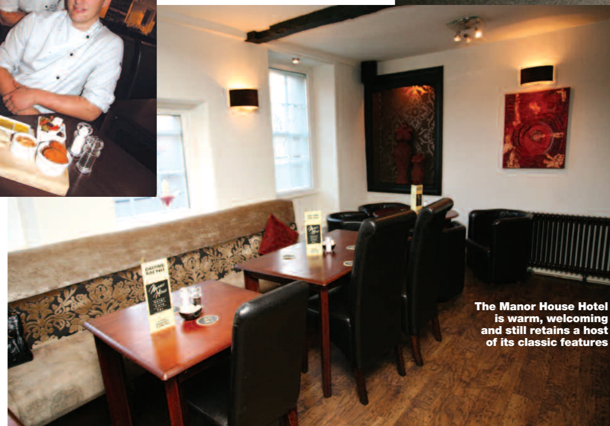
The Manor House Hotel is warm, welcoming and still retains a host of its classic features

There is a buzz in the Tapas restaurant that extends